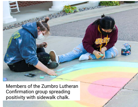
Members of the Zumbro Lutheran Confirmation group spreading positivity with sidewalk chalk.