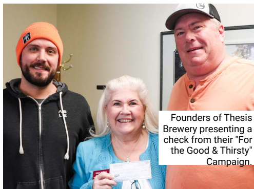
Founders of Thesis Brewery presenting a check from their "For the Good & Thirsty" Campaign.