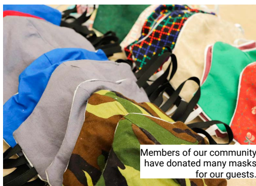
Members of our community have donated many masks for our guests.