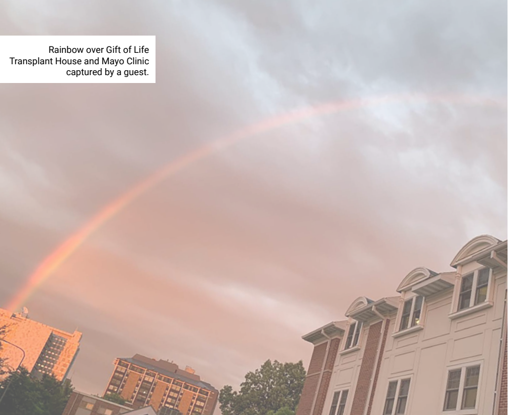
Rainbow over Gift of Life Transplant House and Mayo Clinic captured by a guest.