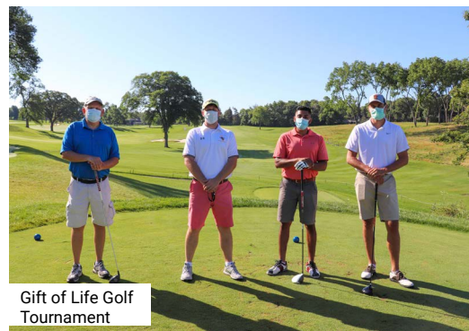
Gift of Life Golf Tournament