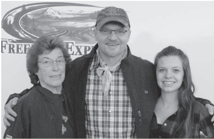
At Trails4Transplants after 2nd transplant

transplant and I came to realize how great Gift of Life truly is. After my transplant we knew that when I was dismissed from the hospital we had a home to go to for my recovery. Only then did I realize how amazing Gift of Life