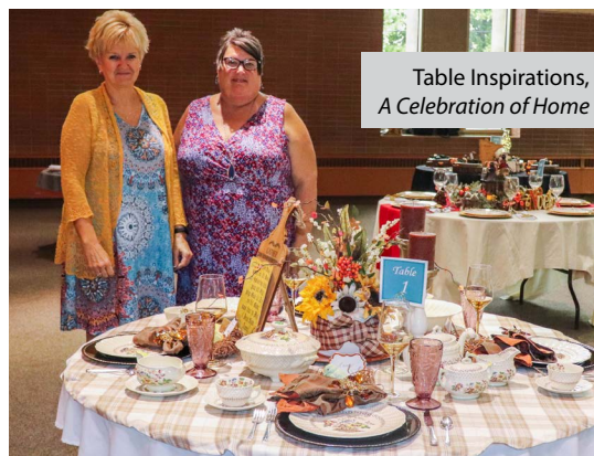
Table Inspirations, A Celebration of Home