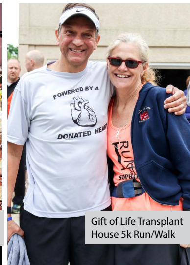
Gift of Life Transplant House 5k Run/Walk