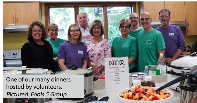
One of our many dinners hosted by volunteers. Pictured: Fools 5 Group