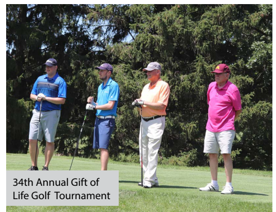
34th Annual Gift of Life Golf Tournament