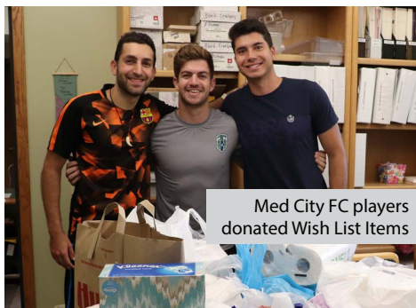
Med City FC players donated Wish List Items