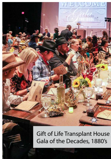
Gift of Life Transplant House Gala of the Decades, 1880's