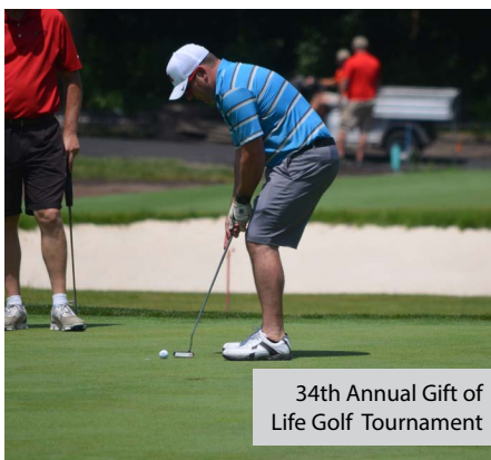
34th Annual Gift of Life Golf Tournament

ENRICHING: ALTRA FEDERAL CREDIT UNION HOME FEDERAL COMMONWEAL