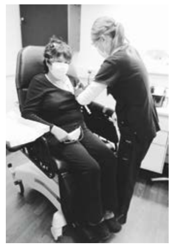
Blood Draw at 705 House

Enhancing service to those who experience transplantation is a goal shared by Gift of Life Transplant House and Mayo Clinic. Providing a blood draw service at Gift of Life Transplant House has been on the wish list of both organizations for several years. However, it was thought to be impossible because of the numerous regulatory challenges associated with providing a clinical service outside Mayo