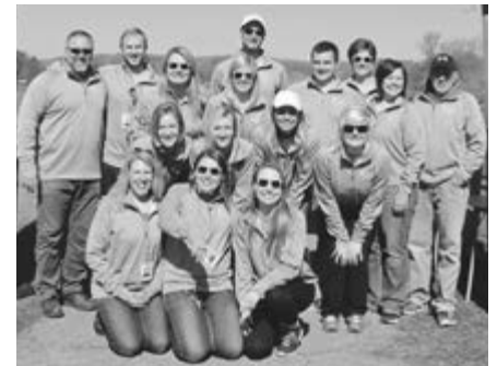
Tim Rasmusson Foundation

Being the Race Director for The Timmay 5k was the most stressful, yet most rewarding experience I have ever been involved with. Reflecting back on my journey, I can now see just how large of an impact it has made, not only on the community, friends, and family involved, but also the immense influence it has made on me. I am more confident and am pleased to note that putting your full effort, heart, time, and self into something truly makes the end result that much more gratifying.