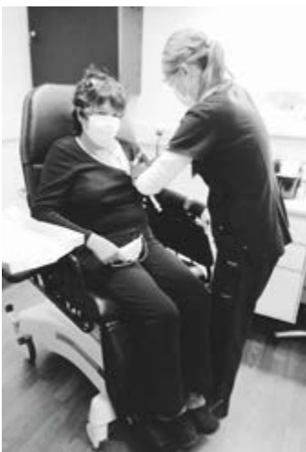
Blood Draw at 705 House

Enhancing service to those who experience transplantation is a goal shared by Gift of Life Transplant House and Mayo Clinic. Providing a blood draw service at Gift of Life Transplant House has been on the wish list of both organizations for several years. However, it was thought to be impossible because of the numerous regulatory challenges associated with providing a clinical service outside Mayo